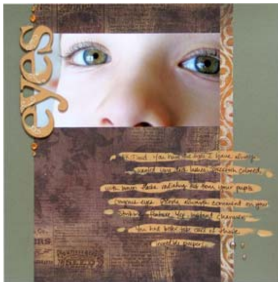
Eyes by Mimi Schramm