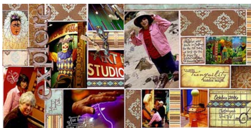
Barb Hogan's Explore layout: