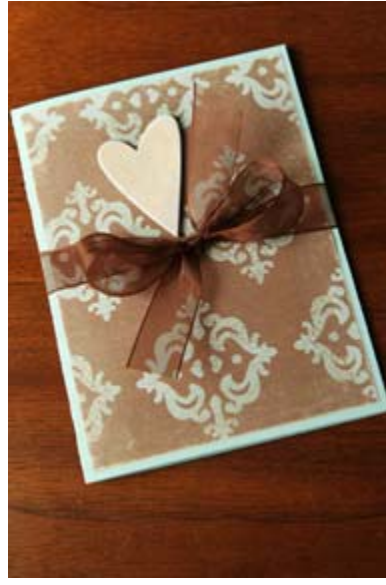
Susan Cyrus' elegant card: