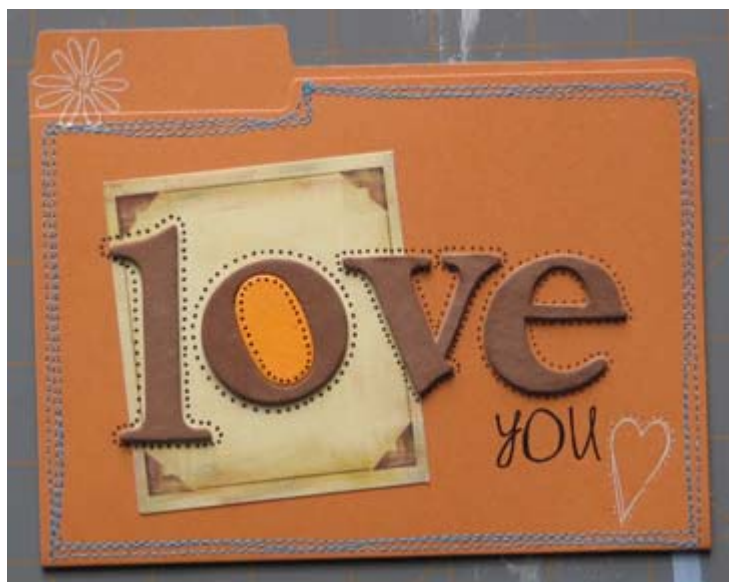
File Folder card by Kimberly Madrid:

As the chipboard shape is so large, try using only half of it on your project to create a great accent. You'll then get double the supply for your money by using the other half on a different project.