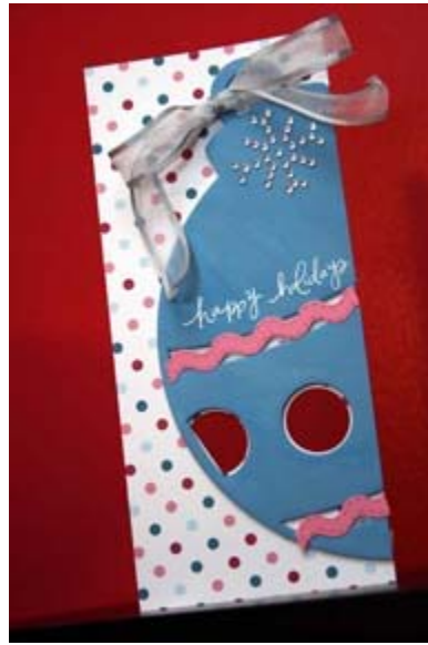
Melanie Bauer shares a tip for making the 'Happy Holidays card:

4-Place pink gingham ribbon over where the edges meet. Create a simple bow, by making loops and placing a brad in the middle of it.