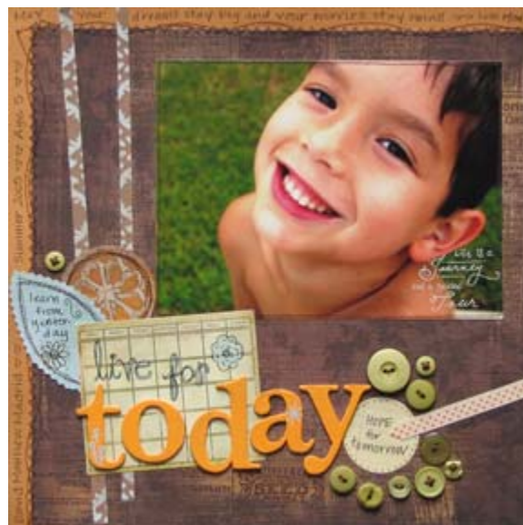
Live for Today by Kimberly Madrid:

Use golden Bazzill as a base. Attach 11" strip of Scrapworks pp (blue side) and an 11" strip of dotted ribbon with staple to the bottom of the page. Adhere 9" strip of Stratford Argyle ribbon on the right side. Cut 4 flowers from the Hang 10 Maui pp and attach. I used a brad in two of them, and the other two "hang off" the edge of the paper. Sand the edges of a 5x7 vertical photo and a 3.5 x 4.5 horizontal photo. Attach both to the page. Cut 3 strips of Scrapworks pp and notch the ends to look like ribbon. Fold and staple all three to the top left corner of the large photo. Paint large chipboard flower orange and attach below large photo. Punch circle from a Scrapworks pp and adhere to the top of the large chipboard flower and top with an inked Bazzill chipboard flower. Ink the Bazzill chipboard title (I used two different colors) and adhere near the top right corner. Cut a 6" strip of Scrapworks pp (blue side) with deco scissors and attach above the title, adding some doodles. Add journaling to the Tilez and in the space between the title and the small photo.