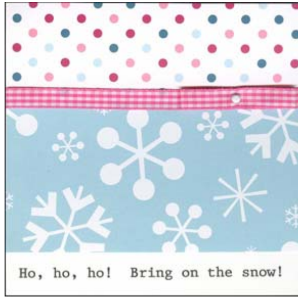
December card by Ashley Gailey:

1-Cut 6x12 piece of white cardstock. Use computer to print off journaling on very bottom of cardstock. Fold in half.