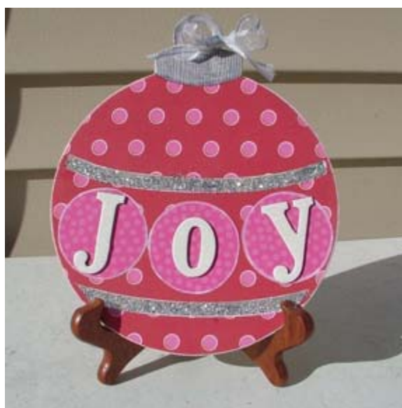
Joy Ornament by Jen Dubbs

Cut Scrapworks pp to fit the bottom of the tin, with the edges overlapping by about a half inch or so. I cut the top edge of the paper with deco scissors, Adhere with your adhesive of choice. I used Art Accentz Terrifically Tacky Tape. (Only my aunt is tackier.) Cut a thin strip of Scrapworks pp to fit the rim of the lid, and adhere. Cut a circle from Scrapworks pp to fit the top of the lid; adhere. Cut four 4" pieces of Downtown ribbon and adhere in an overlapping pattern. Ink a Bazzill chipboard flower and adhere on top of the ribbon. Add some thread to a button, then adhere on top of the Bazzill flower. Fill tin with goodies and find a good friend to give it to!