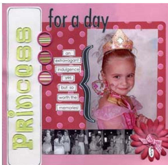
Princess for a day by Jen Dubbs

I used Pattern Paper and ribbon for the kit and added KI alpha soup letters, Bazzil flower (from a past kit) scrapwork hugz (painted to match), button and jump ringz.