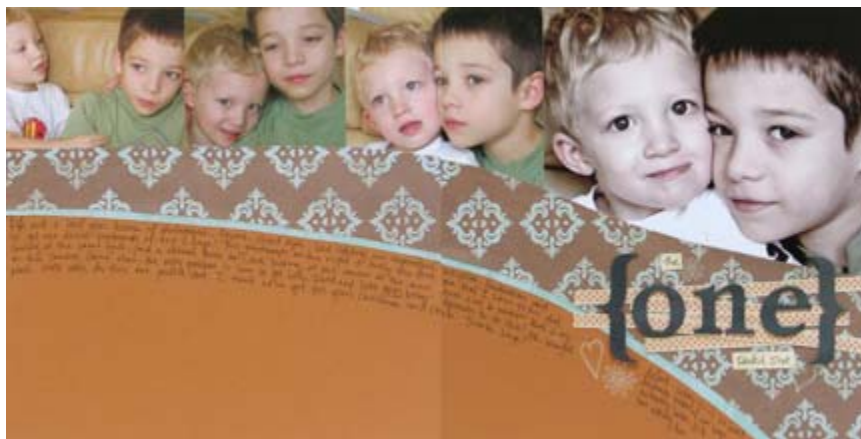
The One Perfect Shot by Mimi Schramm