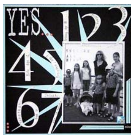
They are all mine