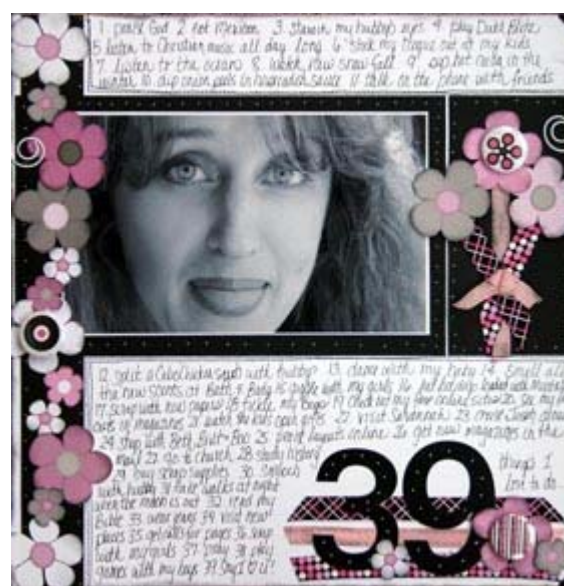
Things I Love