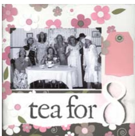
Tea for 8