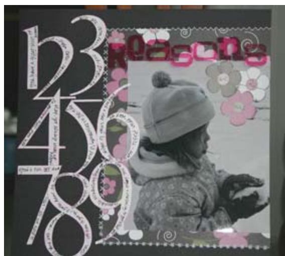
Reasons We Love You