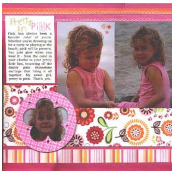
Pretty in Pink

-Sprinkle MM rhinestones around the frame and use it to frame a focal photo.