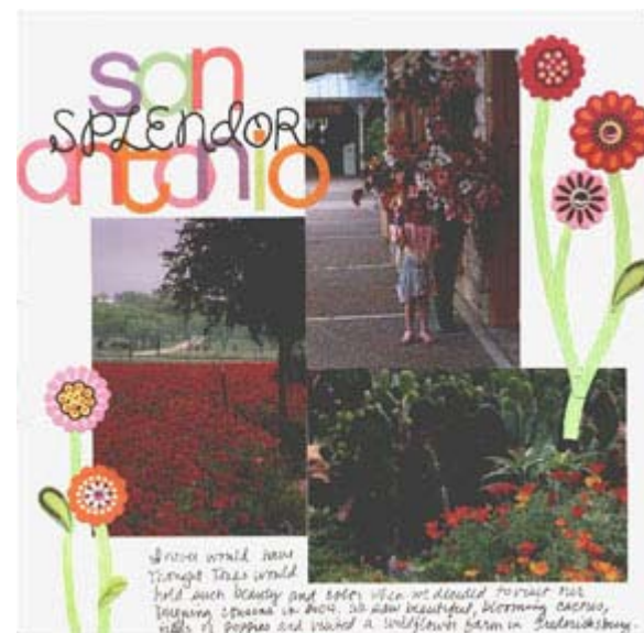
San Antonio Splendor